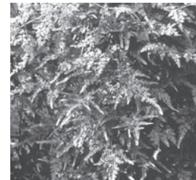
Above: Old World Climbing Fern.