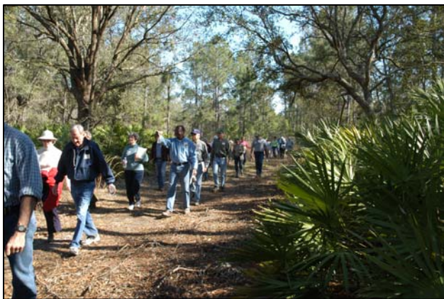
Calling Master Tree Farmers / Wildlifers to lead Stewardship Tours.

July 1 marked the beginning of another year of Forest Stewardship Program activities and this year we plan on continuing the series of Stewardship Property Tours. Property tours are the most requested activity offered through the Program and benefit landowners and natural resource professionals by providing an opportunity to witness and discuss various management objectives and practices in the field and meet with other landowners and professionals. In the last five years we've held a total of 16 tours with over 600 landowners and professionals in attendance.